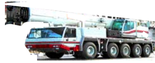
Under Own Power

Unit Two, Unit Three, Unit Four, Unit Five & Unit Six: Enter the license number, state it is licensed in, complete vehicle identification number, year and make. Check one box for unit type. Examples follow: