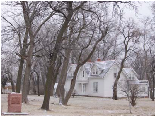
Acquisition of the Rice-Tremonti House City of Raytown

Acquisition of Scenic or Historic Easements and Sites: This category provides funding for acquiring scenic land easements, vistas and landscapes, purchasing buildings in historic districts or historic properties and preserving farmland.