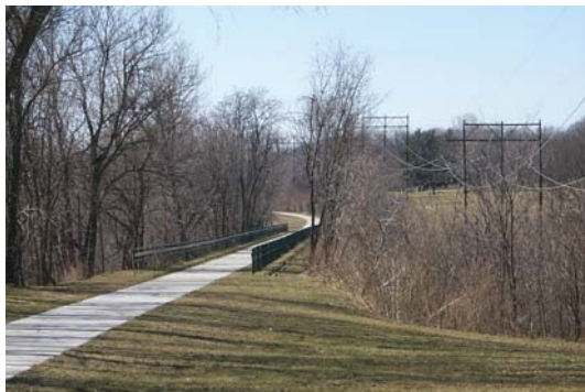
Urban Trail Corridor – Phase 7 City of St. Joseph

Conversion of Abandoned Railway Corridors to Trails: This category provides funding for acquiring railroad rights-of-way; planning, designing and constructing multi-use trails; and developing rail-with-trail projects.