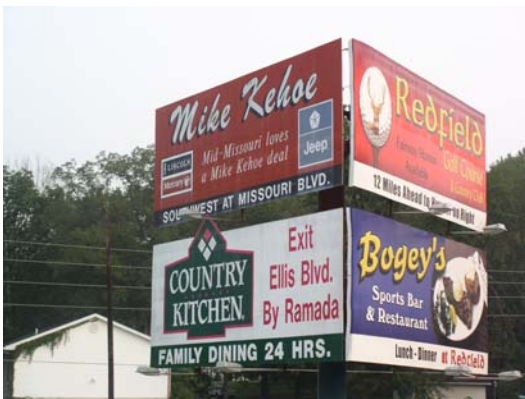
Billboard Baseline Inventory MoDOT Jefferson City

Control and Removal of Outdoor Advertising: This category provides funding for billboard inventories or removal of illegal and nonconforming billboards.