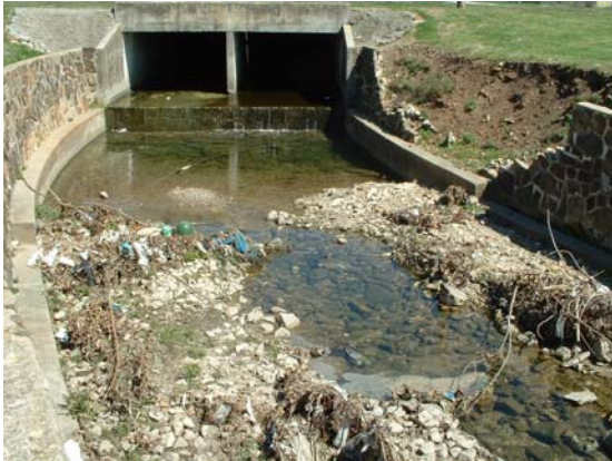
Upper Jordan Creek Greenway City of Springfield

Environmental Mitigation of Runoff Pollution and Provision of Wildlife Connectivity: This category provides funding for runoff pollution studies, soil erosion controls, detention and sediment basins, river clean-ups and wildlife crossings.