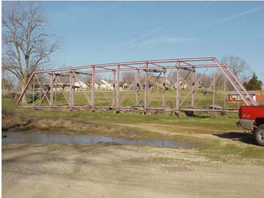
Restoration of the Old Appleton Bridge Village of Old Appleton

Facilities: This category supports the restoration of railroad depots, bus stations and lighthouses and the rehabilitation of rail trestles, tunnels and bridges.