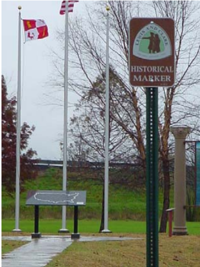
Lewis and Clark Historical Marker Signs MoDOT statewide project Charleston

Scenic or Historic Highway Programs Including Tourist and Welcome Centers: This category provides funding for the construction of turnouts, overlooks, visitor centers, viewing areas and designation signs and markers.