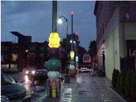
Delmar Community Pathway City of St. Louis

Landscaping and Scenic Beautification: This category provides funding for improvements such as street furniture, lighting and public art, and landscaping along streets, historic highways, trails, interstates, waterfronts and gateways.