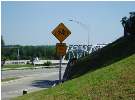
Missouri River Bridge MoDOT Jefferson City

Pedestrian and Bicycle Safety and Education Activities: These programs are designed to encourage walking and bicycling by providing education and safety instruction to potential users through classes, pamphlets and signage.