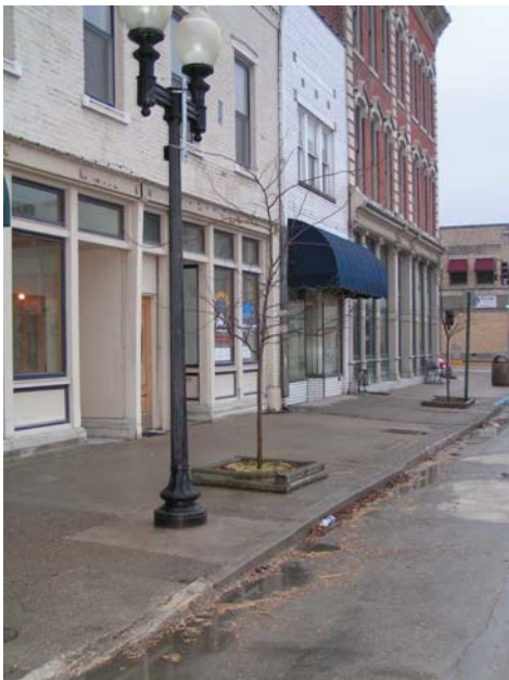
Hannibal Mark Twain Area Restoration Project City of Hannibal