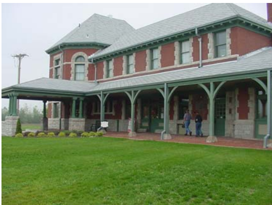
Sedalia Katy Depot / Railroad Heritage Museum City of Sedalia

Establishment of Transportation Museums: This category supports construction of transportation museums, including the conversion of railroad stations or historic properties to museums, with transportation themes and exhibits or the purchase of transportation-related artifacts.